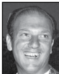
Roberto De Vicenzo

Rain and mud plagued contestants and spectators alike, and Roberto De Vicenzo slipped in the back door for the crown. A Friday rain-out necessitated a 36-hole Sunday. The champ said he didn't even know he was a contender as he fired rounds of 72-74-68-70 to win by the record-high total of 284. Overtaking 16 players in the Sunday rounds, De Vicenzo did not assume the lead until he had just four holes to play. Still, he had to wait for the final group to finish as Dick Mayer bogied 17 to finish one back.